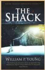
The Shack William P. Young