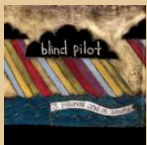
Blind Pilot 3 Rounds and a Sound