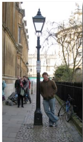
Me standing next to the lamppost in Oxford that inspired the Lion, the Witch, and the Wardrobe.