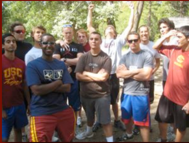
Some of our senior men at this year's Fall Retreat